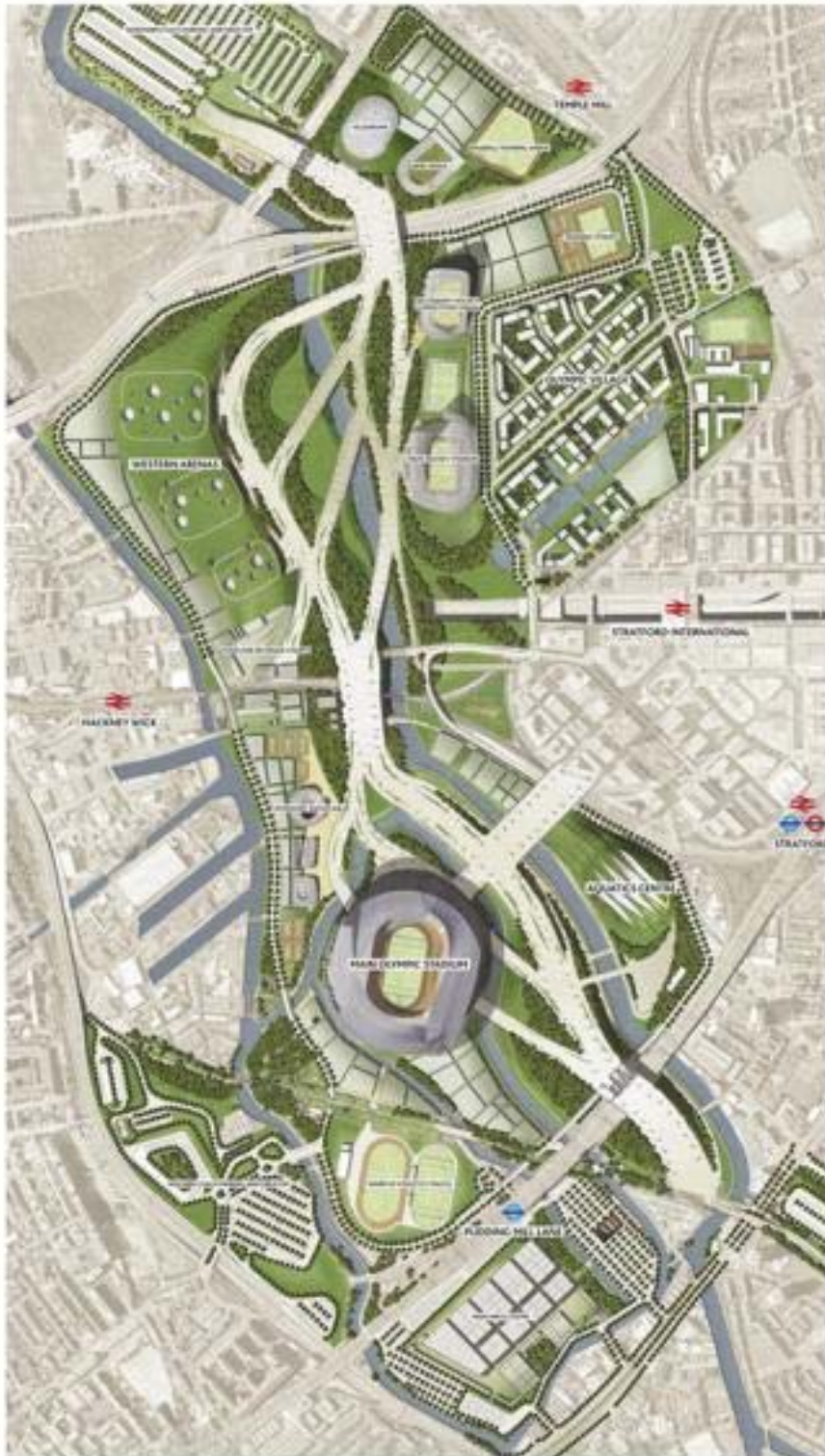
2012 ILLUSTRATIVE OLYMPIC MASTERPLAN